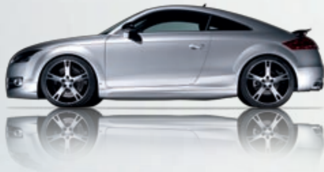
ABT AR sports wheel. Diamond-machined with exclusive finish. Optimized in weight, painted anthracite. A class of its own.