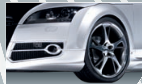
ABT BR sports wheel. Diamond-machined or high-gloss polished, with optional concealed valves, weight optimized and providing perfect handling.