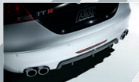
ABT rear skirt set. Inclusive of ABT 4-pipe rear muffler.

What could renowned car tuners find more appealing than a car that is virtually perfect as it is? ABT was only too happy to accept the challenge of dressing Audi's new roadster gemstone into a perfect jewel. Powerful engines, brilliant technological features and sporty, elegant outfit turn the new ABT TT Roadster into a real treasure for the discerning open air fan.