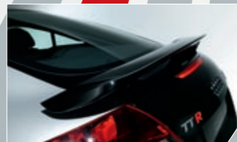
ABT rear wing. Dynamic and tasteful elegance.