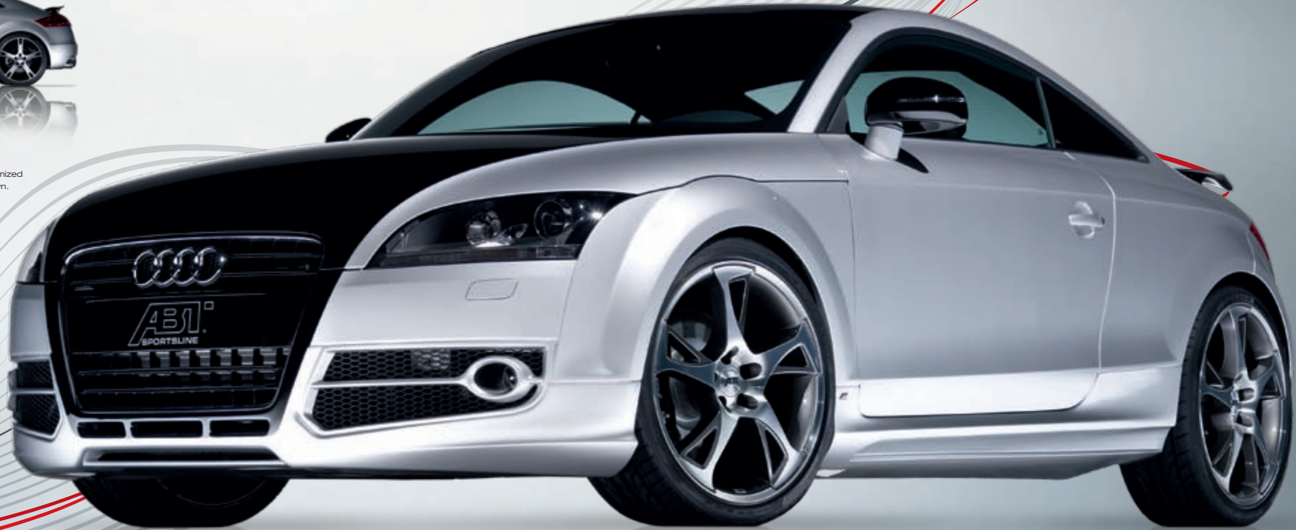
ABT BR sports wheel. Diamond-machined or high-gloss polished, with optional concealed valves, weight optimized and providing perfect handling.