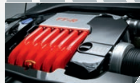
ABT engine tuning. A true power package: ABT Power R, the perfect combination of chip tuning and compressor.