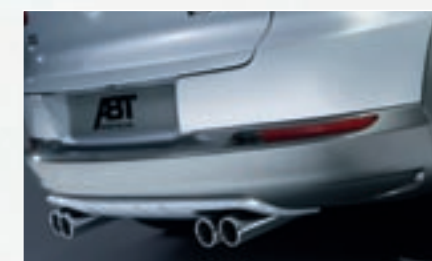
ABT rear skirt set. With chrome-plated 4-pipe rear muffler made of stainless steel.