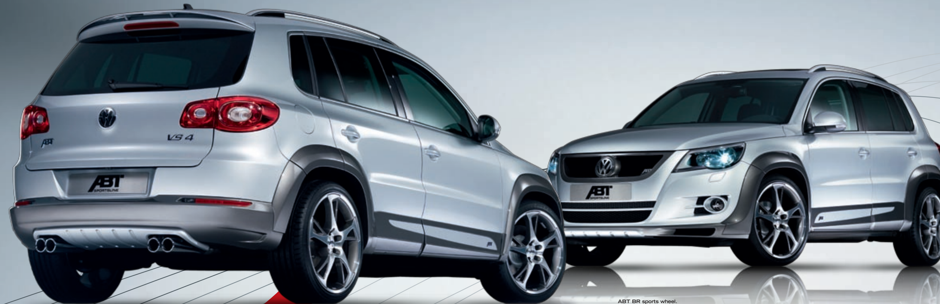
ABT BR sports wheel. Diamond-machined or high-gloss polished, with optional concealed valves, weight optimized and providing perfect handling.

Elegant or dynamic, modern or classical, silver or titanium – but always professionally balanced down to the last detail as far as weight and handling are concerned – ABT sports wheels perfectly round off the individual performance of your car. After all, they clearly show at a glance that they conform with the highest of demands both on the road and on the racing track and that they do not only look good but also want to be driven.