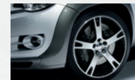
ABT AR sports wheel. | Diamond-machined with exclusive finish. Optimized in weight, painted anthracite. A class of its own.