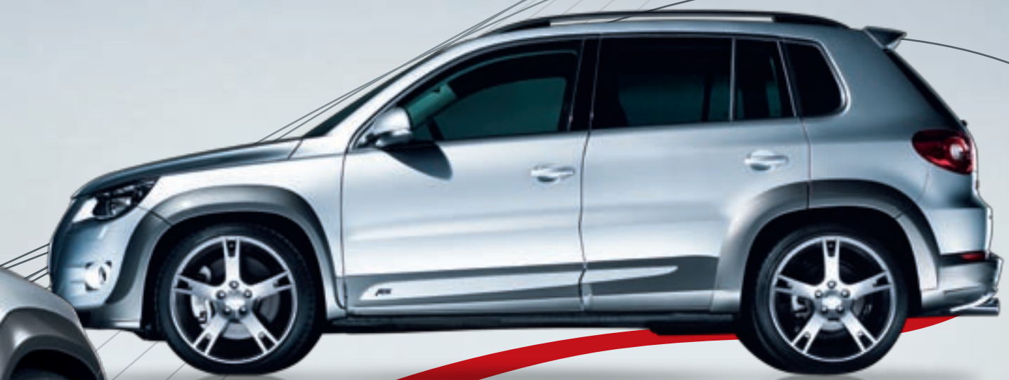
ABT AR Sportfelge. Diamantbedreht mit exklusivem Finish. Gewichtsoptimiert und anthrazit lackiert. Eine Klasse für sich.