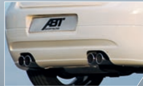
ABT rear muffler. Stainless steel, with four chrome-plated exhaust pipes.

Its model designation speaks for itself and it has been synonymous with affordable power and aggressiveness on four wheels for several generations now. The ABT tuning experts, though, are able to coax entirely new aspects out of even this almost mythical “national sports car”. With an engine power of up to 330 hp, bodywork perfectly tailored to fit the car’s muscular torso and, if desired, even with a carbon-fiber engine hood, the ABT Golf GTI makes one thing clear to every driver, observer and passenger right away: the legend lives on. And how!