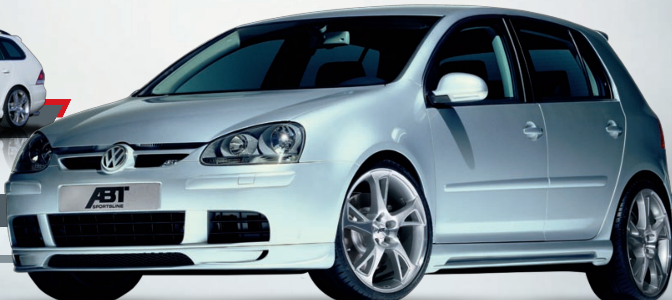
ABT BR sports wheel. Diamond-machined or high-gloss polished, with optional concealed valves, weight optimized and providing perfect handling.