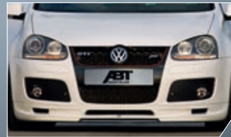
ABT front spoiler lip. Dynamic and tasteful elegance.