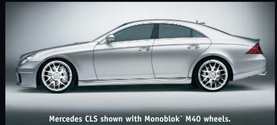
Mercedes CLS shown with Monoblok™ M40 wheels.